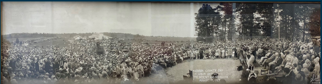
President and Mrs. Hoover Attend Madison County Day, August 17, 1929

All of our registrations are now online in our new Active Camp and Class Manager. Please go to www.hooveridge.com to register. Fall team sports registration (for Youth Sports) will open July 1 and close August 15.